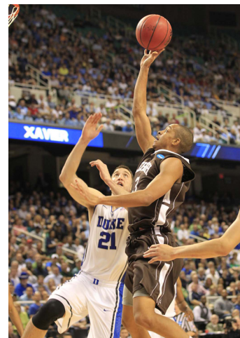
C.J. McCollum scored 30 points as part of the historic 75-70 win over Duke.