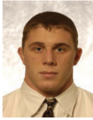
Troy Letters 2004 (165)